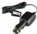
MGC Vehicle Charger Part# MGC-V-CHARGER1