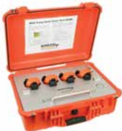
MGC Pump Clip Dock* Part# MGC-DOCK-PUMP High Pressure Part# MGC-DOCK-PUMP-HP