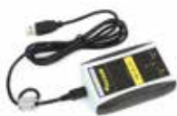
GCT IR Link Part# GCT-IR-LINK