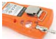
MGC Pump Quick Disconnect* Part# MGC-PUMP-QD