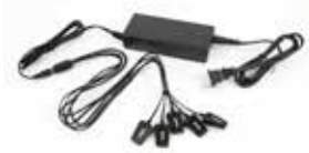
MGC Multi Charger Part# MGC-CHRG-MULTI

*Detector(s) or Telescoping Sampling Probe not included Please contact Gas Clip Technologies for additional spare parts, accessories & gas.