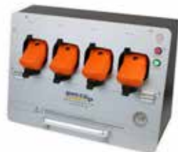
MGC Pump Clip Dock Wall Mount* Part# MGC-WMDOCK-PUMP High Pressure Part# MGC-WMDOCK-PUMP-HP