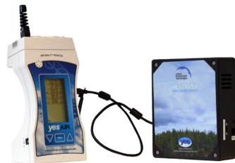
YES AIR attached to a remote particulate sensor, YES DUST.