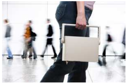
YES Plus LGA (picture above) is housed in a rugged ABS enclosure with swivel handle to act as a stand support or for carrying the instrument.