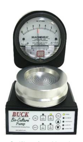
Calibration Head Attached to Pump