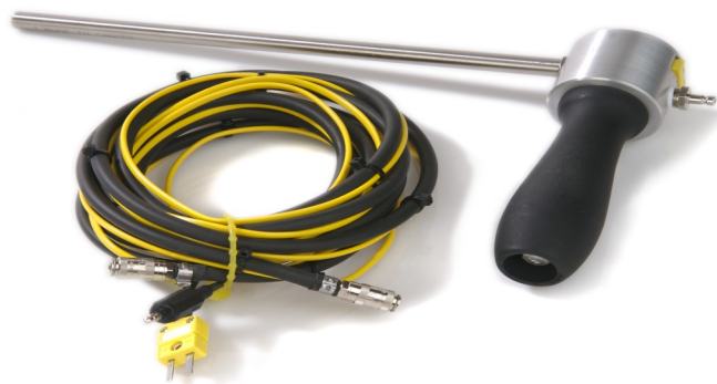
9" L x 3/8" O.D. Inconel probe with 10' viton hose

Built in Printer: 2" Graphic Thermal Printer